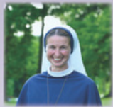
ST. MARY GRACE