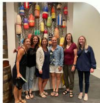
A Women's Life Group enjoying some treasured social time together