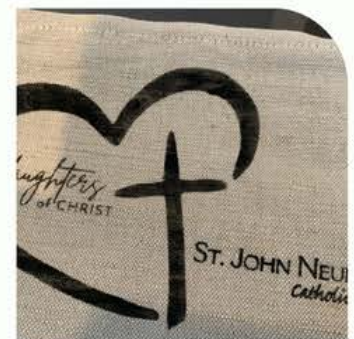
The "Daughters of Christ" meet monthly for their time of prayer and study