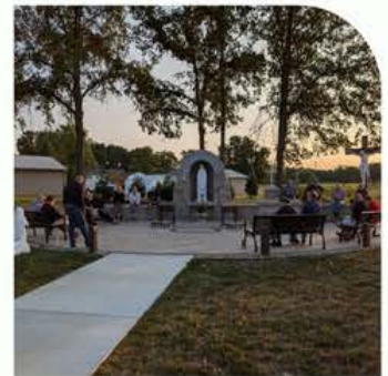
TMIY Men's Life Group praying a Rosary in the early morning