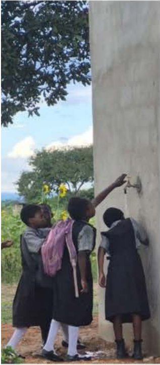
Schoolchildren in Zambia receive clean water after the borehole project in a community where water had once been unavailable for 20 miles. (Photo above)