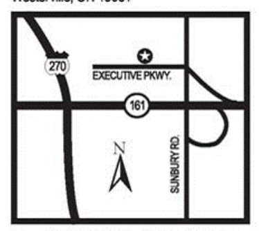
From I-71: Exit at I-270 East. Exit at Rt. 161 East. Exit at Sunbury Road. Turn right onto Sunbury Road. Turn left (at McDonalds) onto Executive Parkway. Hondros College's building is 1/4 mile on the right.

Hondros College, 4140 Executiive Parkway Westerville, OH 43081