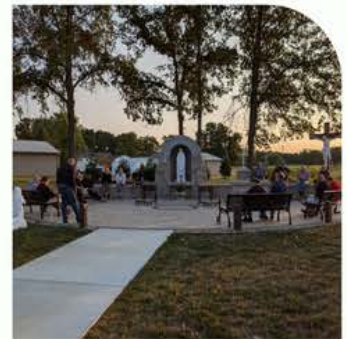
TMIY Men's Life Group praying a Rosary in the early morning