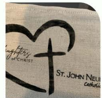
The "Daughters of Christ" meet monthly for their time of prayer and study