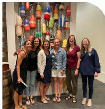
A Women's Life Group enjoying some treasured social time together