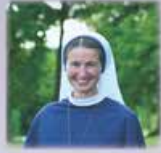
ST. MARY GRACE